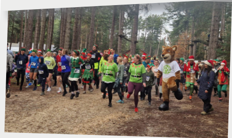
Mental Elf 5k Run