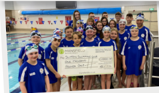
Sutton Swimming Club