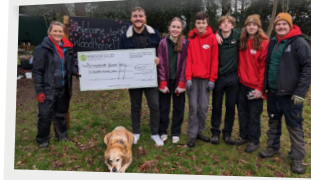
Nottinghamshire Wildlife Trust