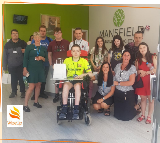
Pupils from Portland College on a visit to our Mansfield branch

Last year, the charity reached over 300 students from four local schools, including The Brunts Academy, Ashfield School, Portland College and The Beech Academy. Sessions provided information and activities on topics such as budgeting, taxation, pensions, savings and more.