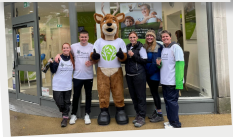
Branch to Branch Walk